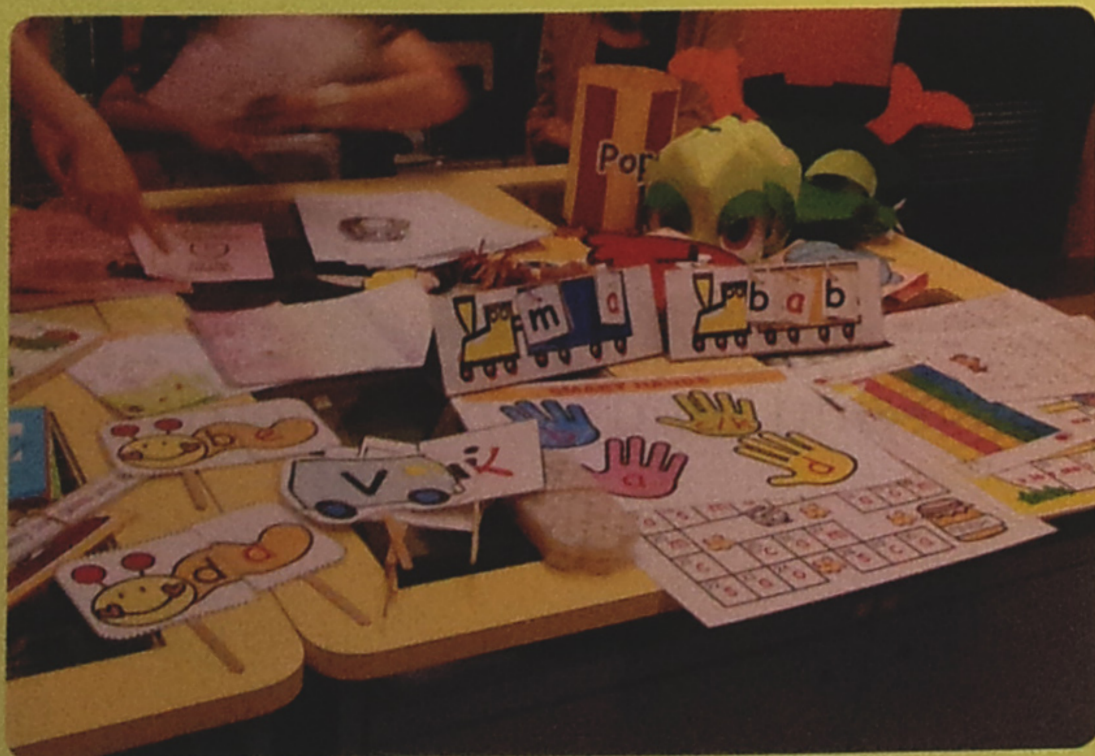
Teachers prepare English-learning materials to teach students English in a fun way.

The Phonics (P) component of the course cultivates students' pronunciation. Using materials prepared by teachers, students learn to blend vowels and consonants to form sounds. The phonics lessons are infused with numerous games and Activities (A) to encourage constant participation.