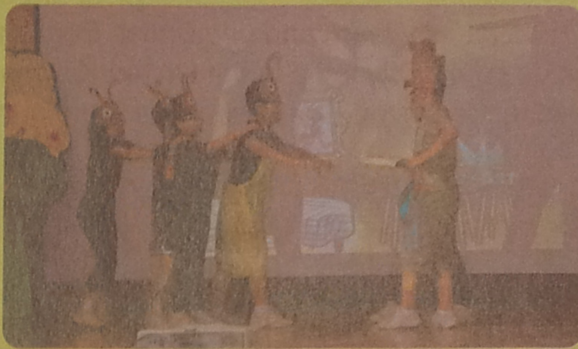
The Ugly Duckling

P5 and P6 students to use English expressively. Students read aloud the scripts with appropriate intonation and expression in front of a class on a regular basis. Therefore, P4 – P6 students can bring the language of English to life through performing arts.